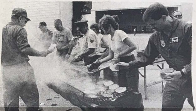
Volunteers from the 465th Tactical Fighter Squadron served up hamburgers and hotdogs to the families of the 507th Tactical Fighter Group.